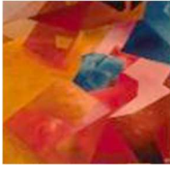
Espanhola Quebrada, Acrylic on Canvas, 80 x 80 x 5 cm