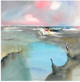
Calm Refuge, Mixed Media on Canvas, 60 x 60 x 7 cm