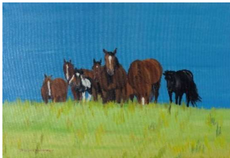
Herd of horses relaxing, Oil painting on canvas, 76 x 53 x 3 cm