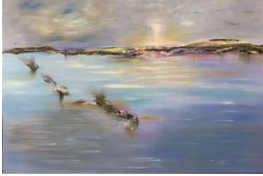
Belonging, Oil on Canvas, 80 x 120 x 7 cm