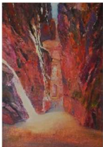
Petra, Jordan, Oil on Canvas, 69,8 x 49,5 x 3,8 cm

Since 2011 this work has been the most important abstract artwork of the artist Francisco Lacerda. This artwork represents the colours of Spanish culture and the lifestyle of Spanish people. The movements in the painting are the movements of a Spanish girl, dancing the famous dance called "Flamenco". But mean time, the artist tells us that we can see more than a "flamenco" dance, we can see the movement of a big and coloured culture. We can see a big country where different people, with many different cultures and visions, after the civil war of 1939, created together a strong country. We can see that in the warm colours represented by the red and orange, and the cold colours, represented by the blue and purple. The black and white are the harmony colours to the artwork.