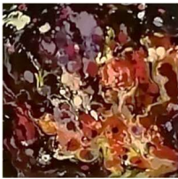
Space with Colours, Acrylic on Canvas, 50 x 50 x 4 cm