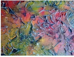
Raizes, Mixed Media on Canvas, 40 x 50 x 12 cm