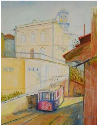
Lavra Elevator - Lisbon, Oil on Canvas, 69,8 x 49,5 x 3,8 cm