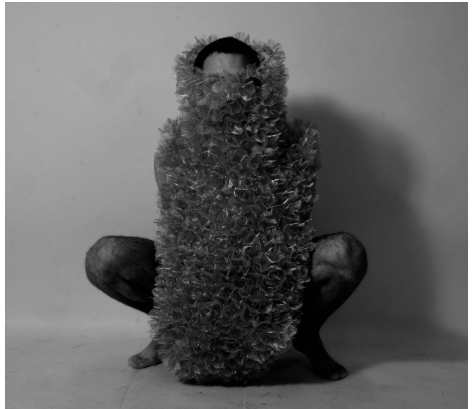
©Rodolfo Lopes “Earth in Man” 27 x 40 cm Edition of 10 Sticker Mounting On 10mm Foam Board 400 euros Instagram: rodolfoledesart