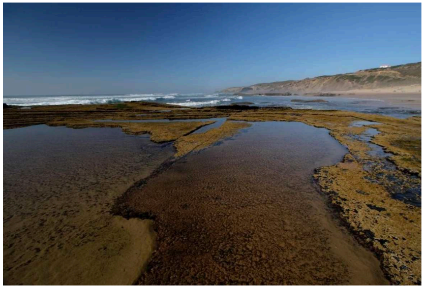
©Cristina Albaker "Portugal" 27 x 40 cm Edition of 10 Sticker Mounting On 10mm Foam Board 500 euros Instagram: photograarte