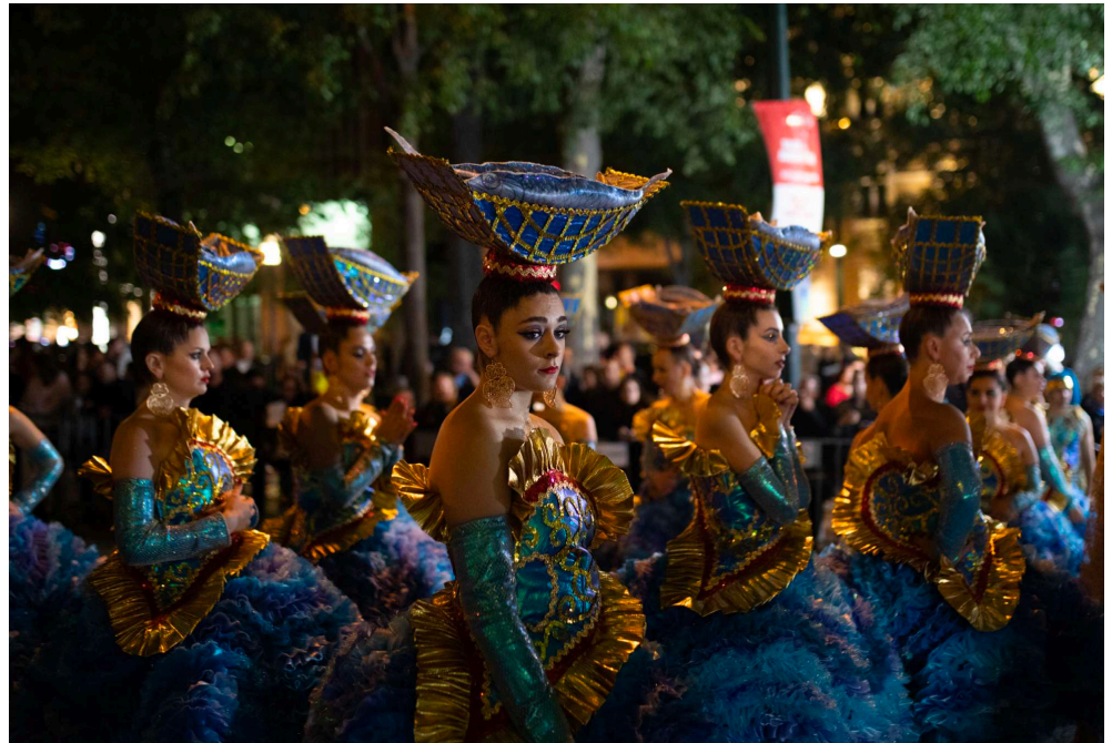
©Gonçalo Fonseca “Sinto um Vazio no Casario” / “Disappearing Alfama” 27 x 40 cm Edition of 50 Sticker Mounting On 10mm Foam Board 475 euros Instagram: goncalo.fonseca