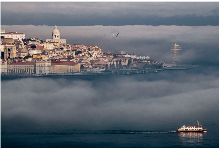
©Marc Sarkis Gulbenkian "Brumas de Lisboa" / "Mists of Lisbon" 27 x 40 cm Edition of 10 Sticker Mounting On 10mm Foam Board 500 euros Instagram: marc.s.gulbenkian