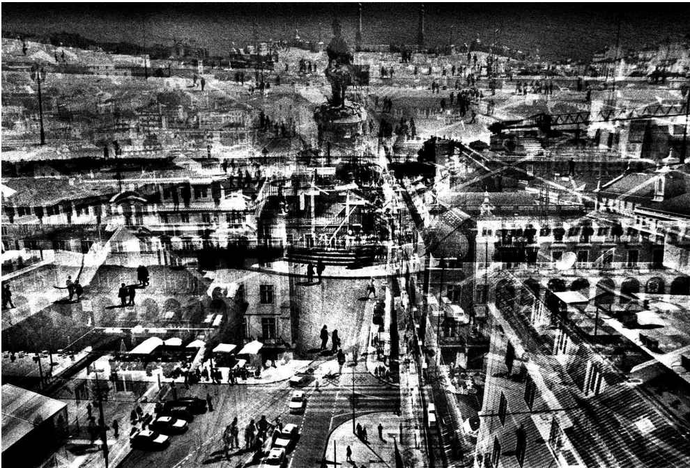
©Ricardo Reis "Lisbon Surrealism" 27 x 40 cm Edition of 10/25 Sticker Mounting On 10mm Foam Board 500 euros Instagram: ricardojorgereis