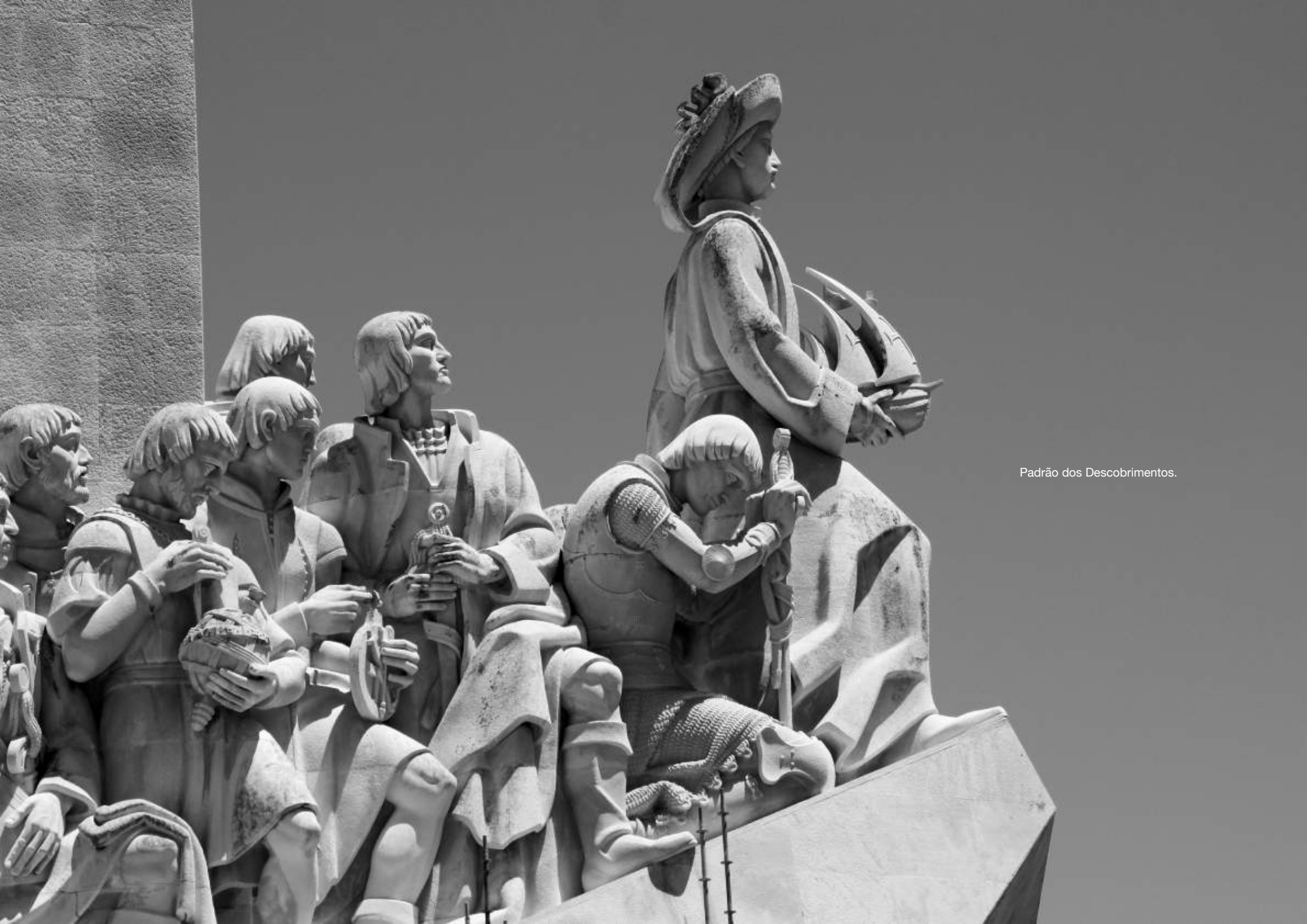
Padrão dos Descobrimentos.