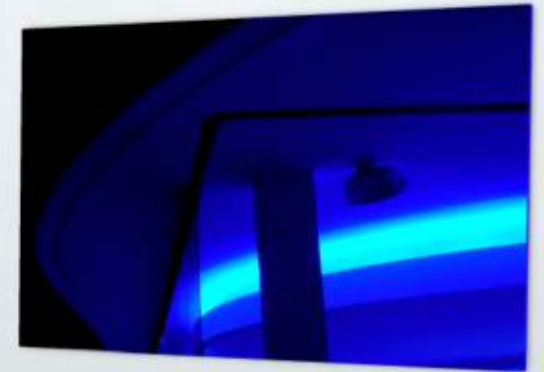
Metaverse exhibition. VR1