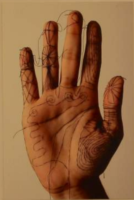
Aurea Museum exhibition.