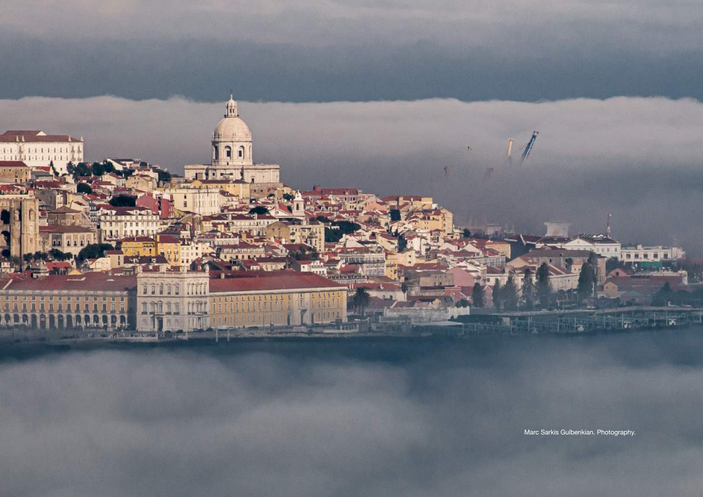
Marc Sarkis Gulbenkian. Photography.