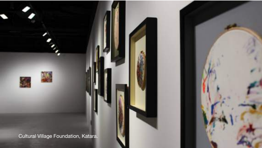
Cultural Village Foundation, Katara.