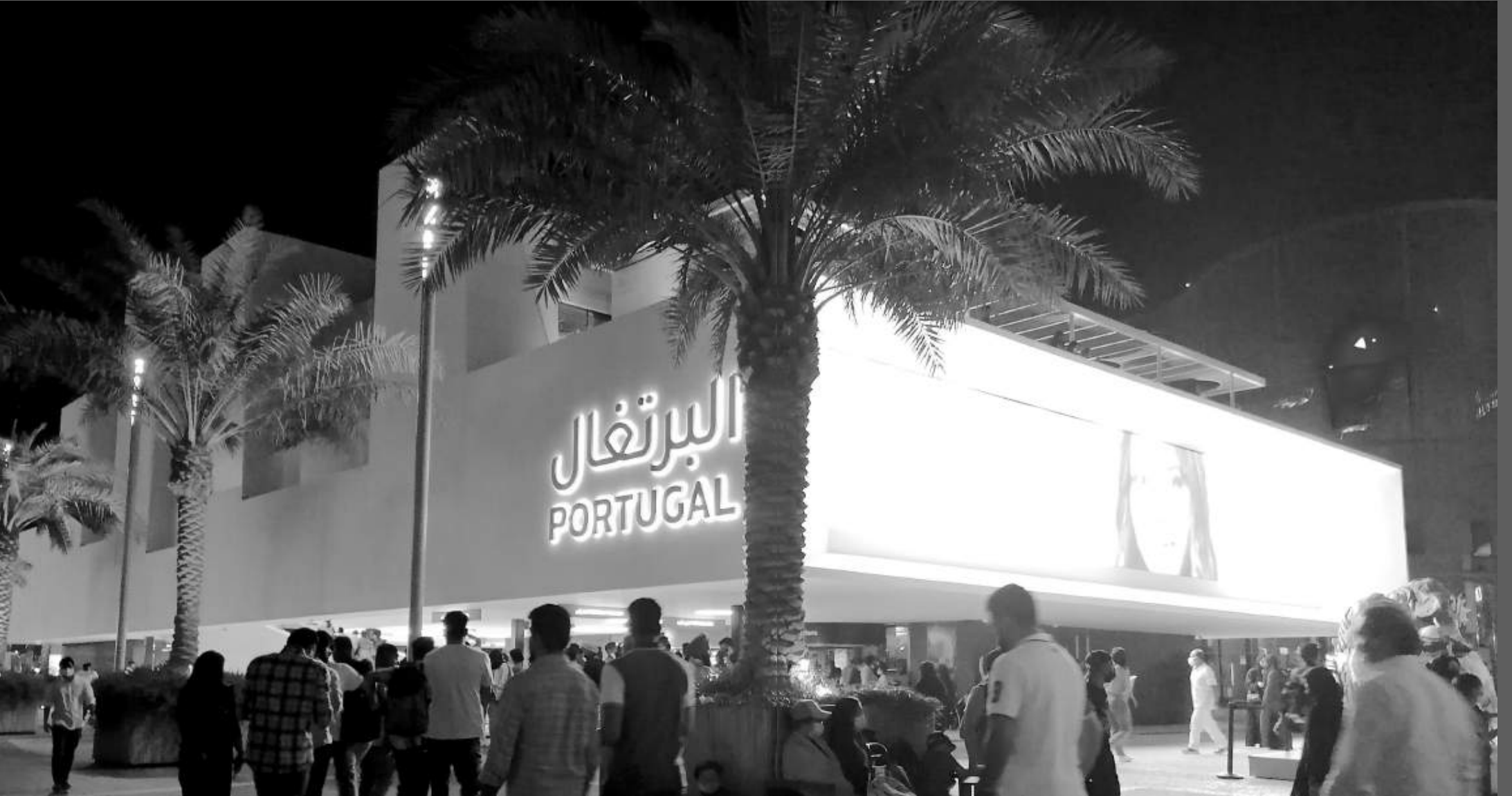
EXPO Dubai 2020 exhibition.