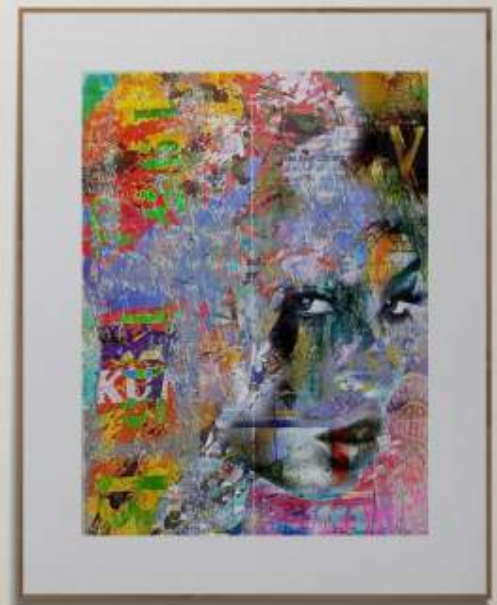
Adélia Clavien. Painting and Photography.